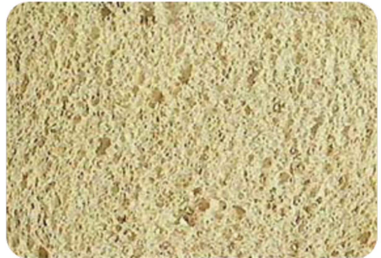
0.3% Finamul-4050L Mean Diameter: 1.40 mm