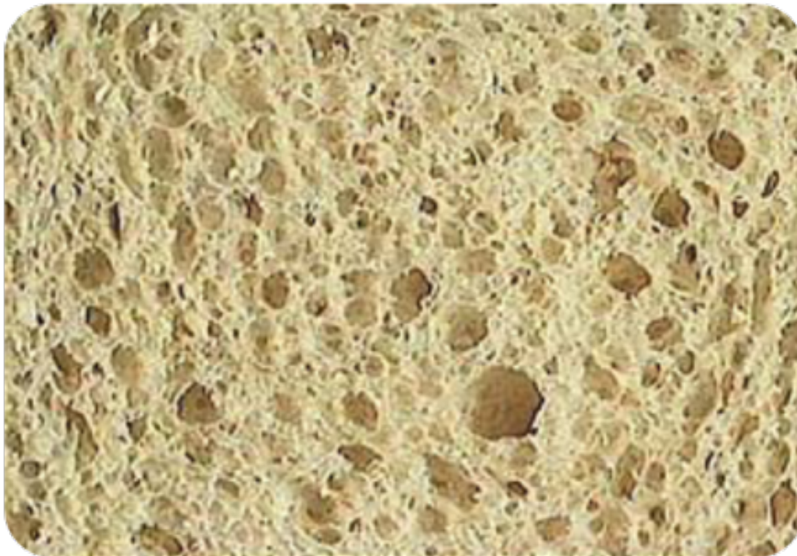
Control Mean Diameter: 2.01 mm